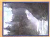
Rainbow Falls - Aare Lake

Maps are created by: Mapmaker - mapping, geographic systems, software development and web services (250) 674-3337 www.mapmaker.com info@mapmaker.com Publication Layout and Design, and Photography by: Image N'Air Works - fine art and graphic design INAW@telus.net