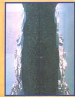
Kingling - Clearwater Lake