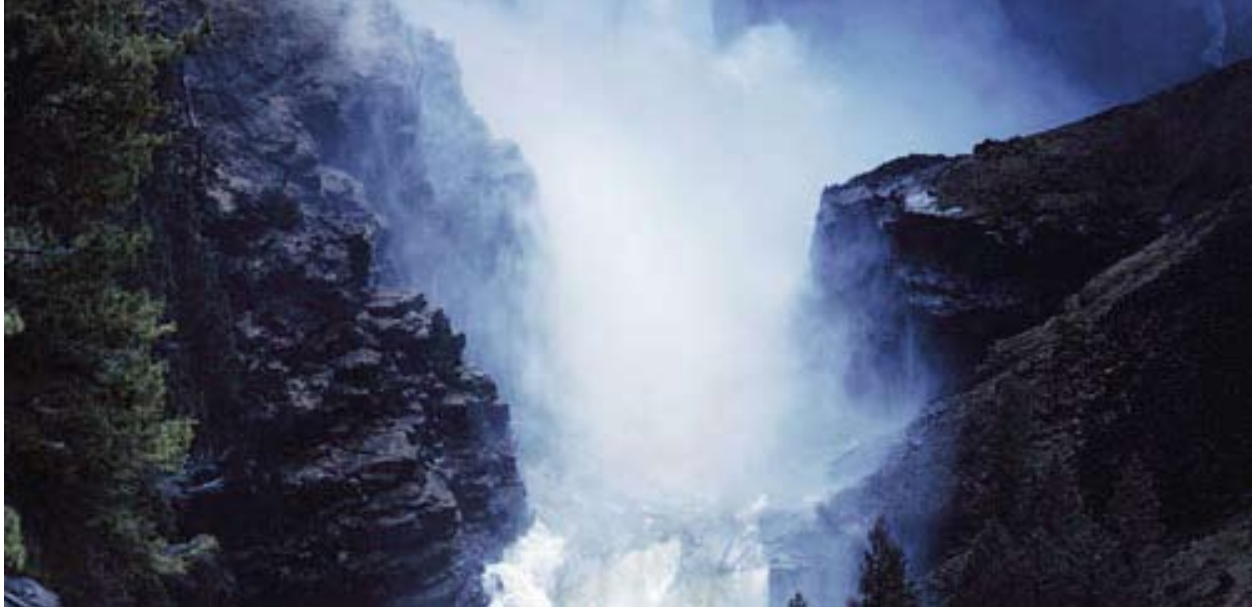
Helmcken Falls, Clearwater, BC